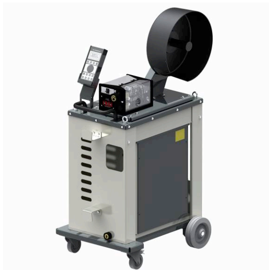
Semiautomatic Weld Package SAM: Trolley with power source, wire feeder, wire spool holder and Q1 hand weld controller

Further information can be found on www.sks-welding.com .