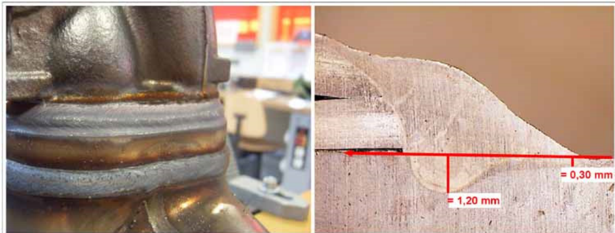
2: The macrosection of a three-sheet connecting a turbocharger housing on the manifold clearly shows the perfect quality of the weld seam and joint.