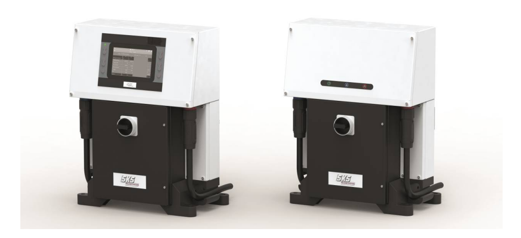
Concept 2020 Power Source